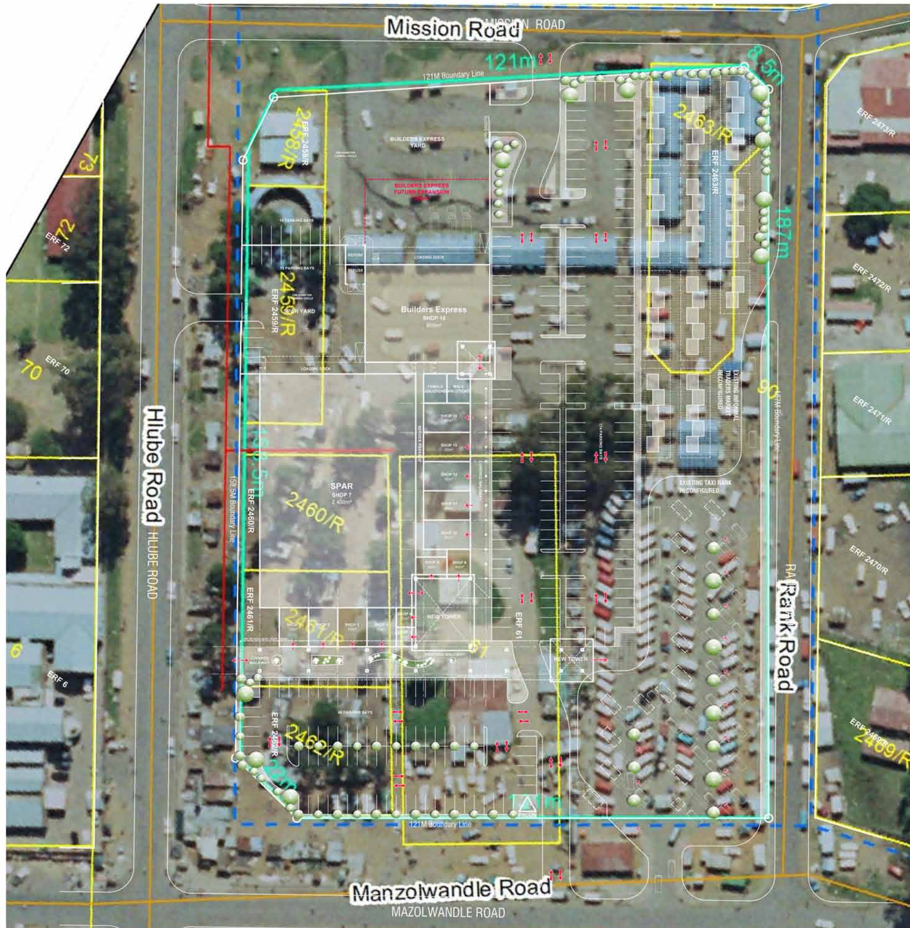
Master Site Plan SCALE 1:500 - A1